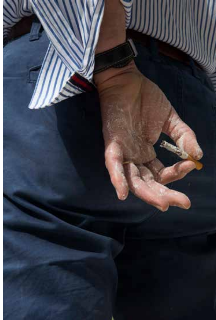
Wrong – 2016 Series Domestic Flight C-Print on dibond 110 x 73 cm edition 5 + 2 ap