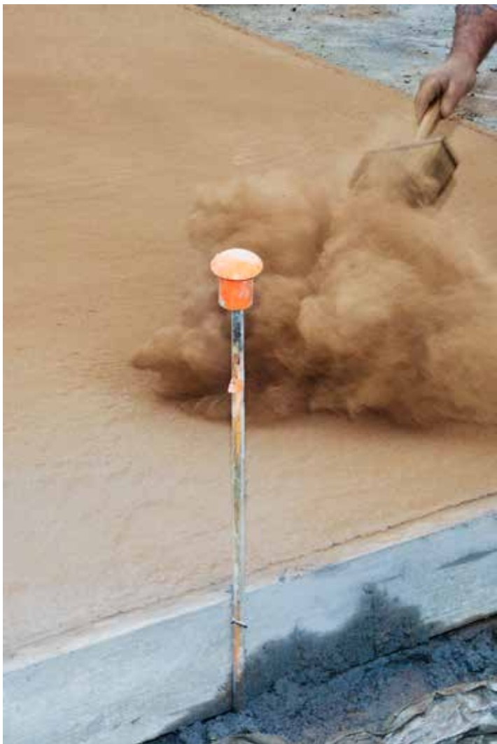
Dôme orange sur fond mat – 2014 Series Domestic Flight C-Print on dibond 110 x 73 cm edition 5 + 2 ap