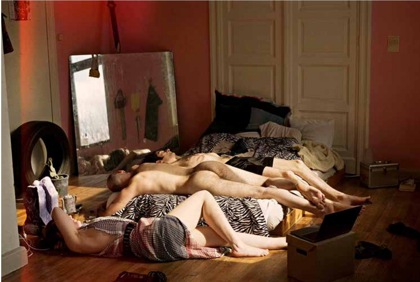
Slumber Series Salut Soleil (qui sait mourir) 2011-2021 C-Print on dibond 110 x 73 cm edition 3 + 2 ap