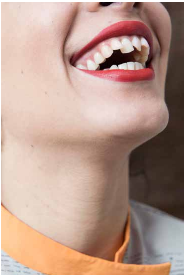
No fear – 2016 Series Domestic Flight C-Print on dibond 110 x 73 cm edition 5 + 2 ap