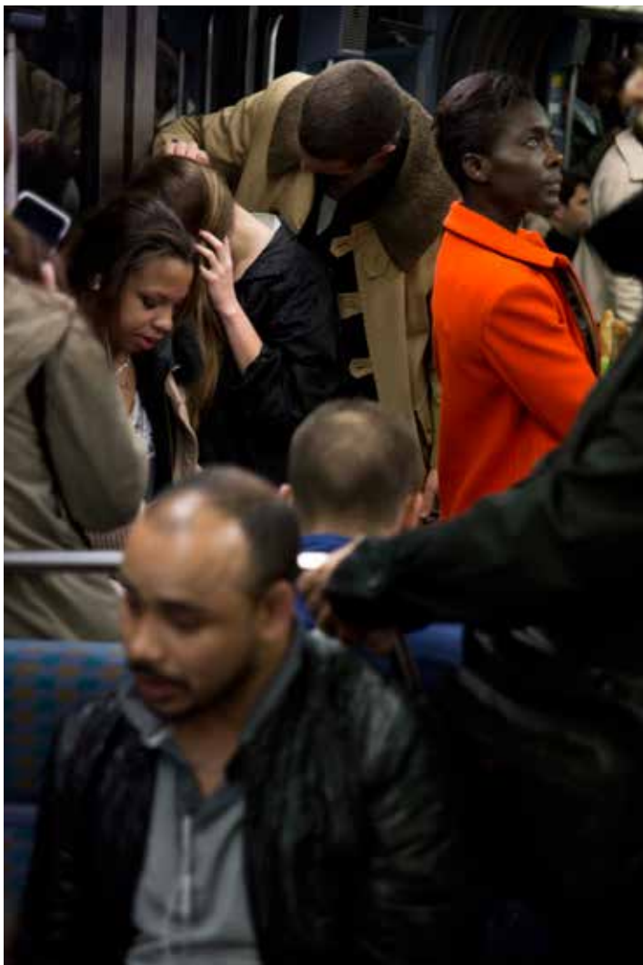
Untitled – 2017 Series Total Ground C-Print on dibond 20 x 30 cm edition 5 + 2 ap