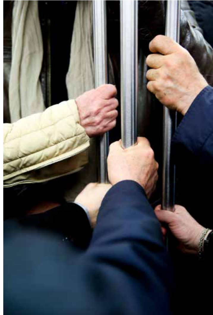
Untitled - 2016 Series Total Ground C-Print on dibond 20 x 30 cm edition 5 + 2 ap