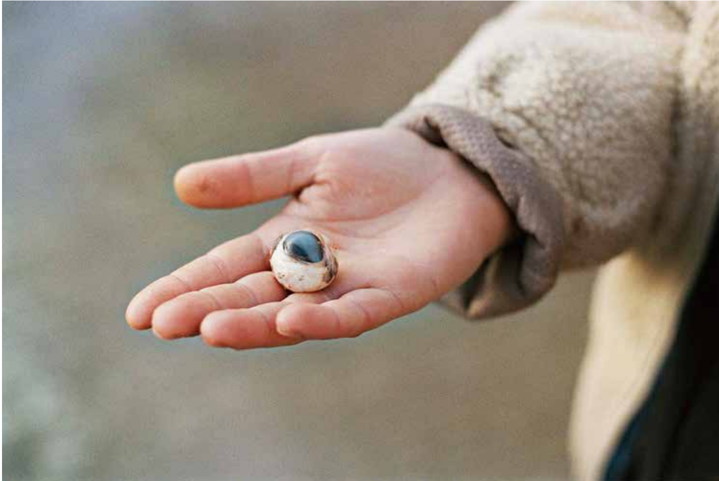
Eye Ball Series Salut Soleil (qui sait mourir) 2011-2021 C-Print on dibond 110 x 73 cm edition 3 + 2 ap