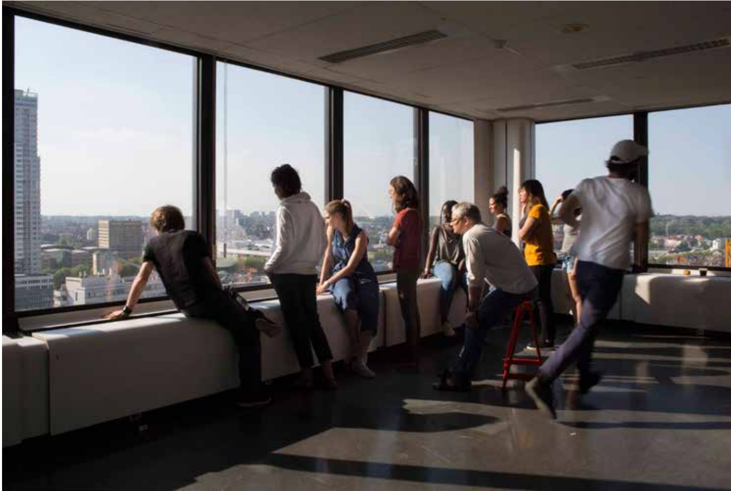
Triptych « Procession » Procession I – 2018 Series Images du dedans C-Print on dibond 130 x 86 cm edition 5 + 2 ap